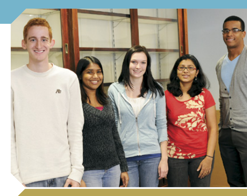
(Above) Pharmaceutical Sciences Students. (Below) PharmD Student Leaders

What he likes best about his new facility is walking down the fourth floor hallway from his office to laboratories