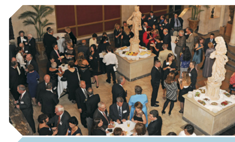
Gala Dinner Dance at the Statler City

The school would like to acknowledge our sponsors as well as all who participated in our events for making the dedication and grand opening of Kapoor Hall such a success. We look